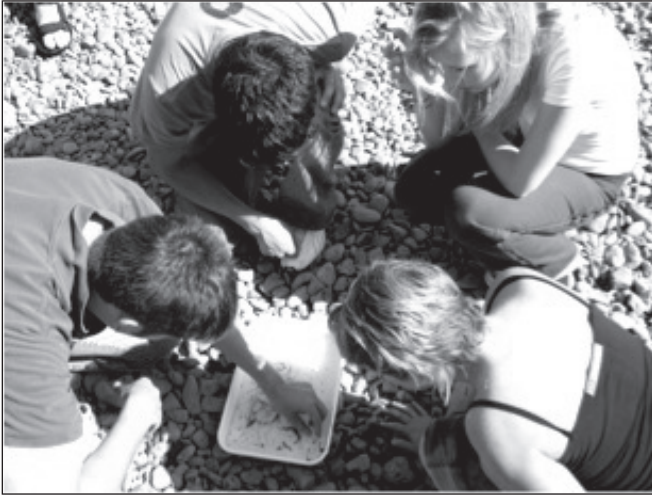
Australian undergraduate students engaged in research.

focusing their efforts on teaching well” (Department of Education and Skills, 2003, 55). While the U.S. higher-education system has developed a wide range of institutions, internationally there are a number of systems that until recently strove for similarity of institutional missions, including connections between teaching and research. Such systems now are becoming increasingly differentiated on U.S. lines, developing international-level research universities and other more local, vocationally focused higher-education institutions.