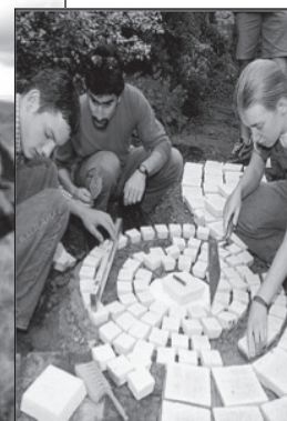
Australian undergraduate students engaged in research.

Several useful case studies on undergraduate research from the latter project are available on the Centre for Active Learning’s Web site ( resources.glos.ac.uk/ceal/resources/casestudiesactive-learning/undergraduate/index.cfm ).